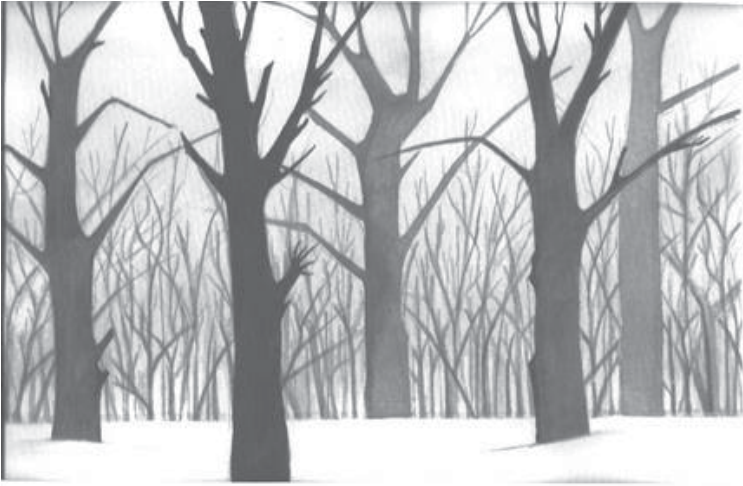
Woodland by Janet Sargent

You are allowed 10 minutes to fill the required details. All the details are important and hence must be filled carefully and neatly in CAPITAL LETTERS.